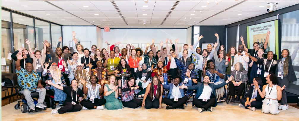
Participants at the global digital summit.

KICTANet participated in the Global Disability Convening at the Ford Foundation Centre for Social Justice. The Global Disability Summit brought together disability and non-disability organisations to build solidarity and advance disability rights. Key discussions centred around technology inclusivity, highlighting the need for user-centred design, accessible usability testing, and the implementation of existing accessibility laws. The summit also explored innovative funding strategies for disability advocacy, emphasising the importance of recognising diverse resources, fostering inclusion in decision-making, and adopting flexible funding models.