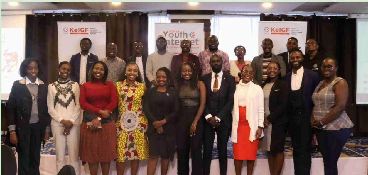
A section of the Kenyan youth in a group photo during the Kenya Youth IGF held in Nairobi.