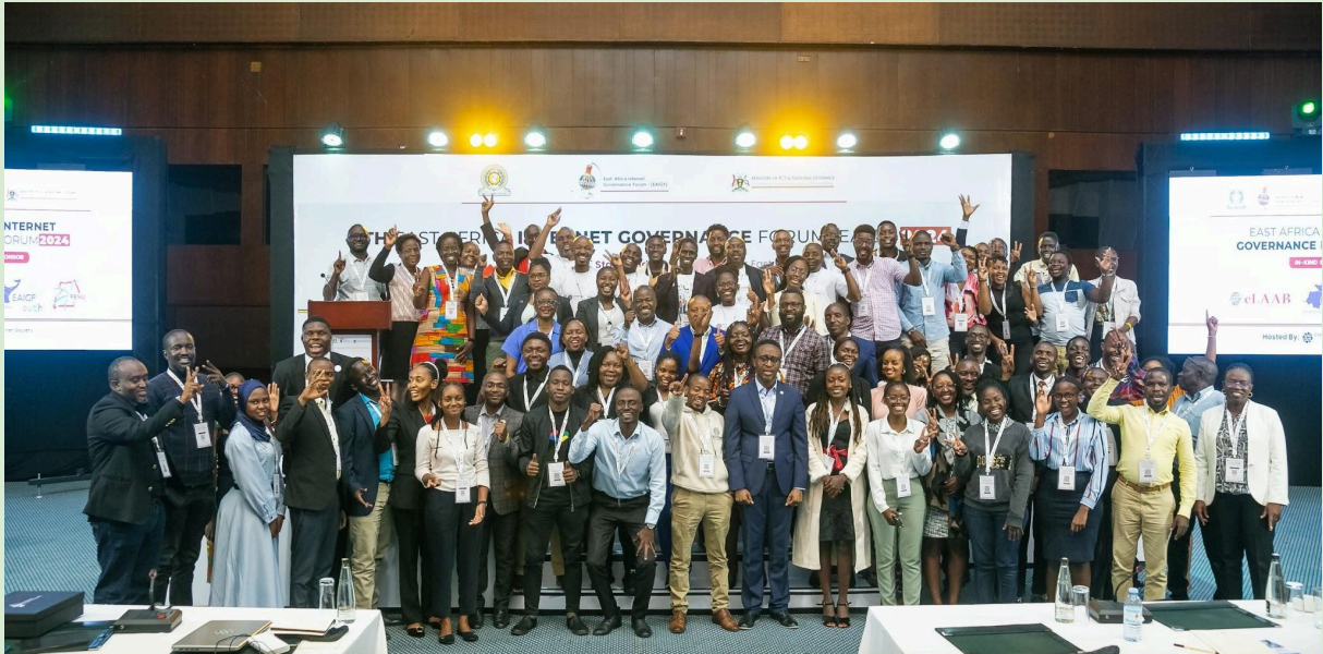
A section of the delegates during the East African Internet Governance Forum held in Kampala, Uganda.

As part of the broader East African Internet Governance Forum (EAIGF) that was held between 11-12 September, the Kenya IGF plays a vital role in fostering dialogue and driving positive change in the region's internet governance landscape. The rotational nature of these forums helps bring internet governance conversations to individual countries and strengthens regional integration efforts. In addition, it effectively contributed to shaping the global understanding of internet governance challenges and opportunities, ensuring that local perspectives are integrated into broader international discussions at the 19th annual Internet Governance Forum (IGF) held in Riyadh, Saudi Arabia, from December 15–19, 2024.